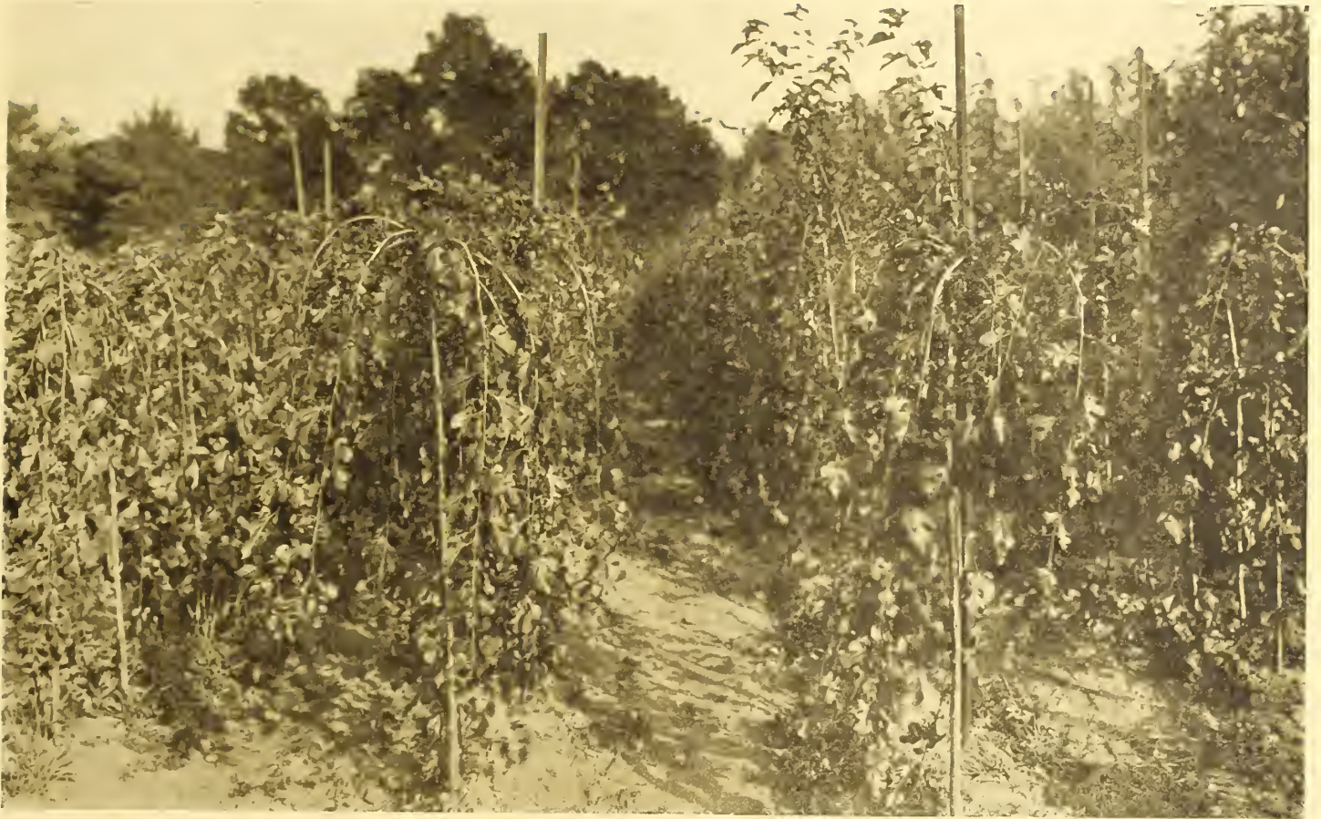
Our Teas' Weeping Mulberries